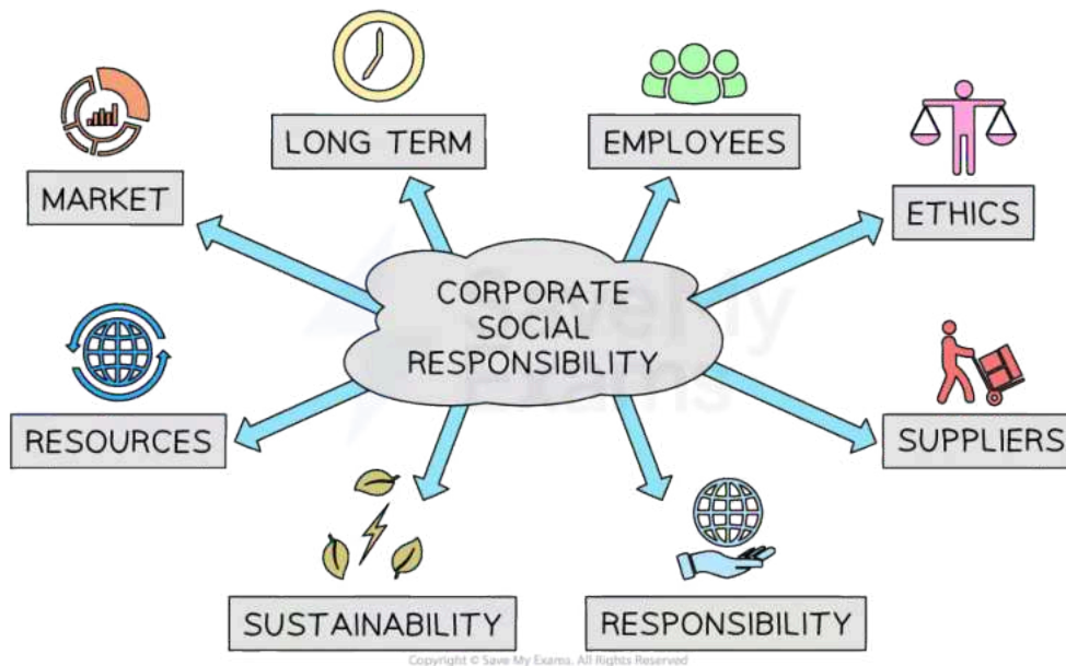
Diagram: social responsibility goals

Corporate social responsibility goals can be focused on a range of different stakeholders